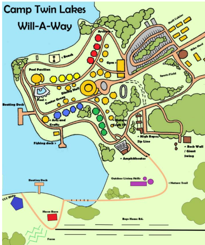
Camp Twin Lakes Winder, GA September 20-22, 2024